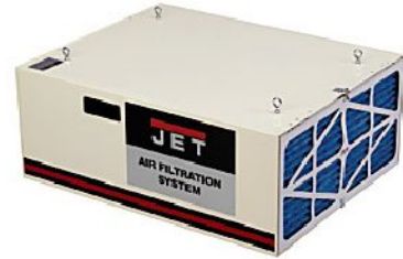
and a shop air filter