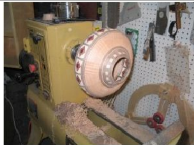
July 21st Added more layers and turned