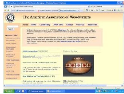
Made Photo of the Day on the AAW website on August 11th