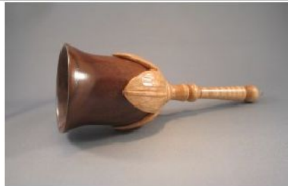
New Video Christmas Ornament 2 A Christmas Bell