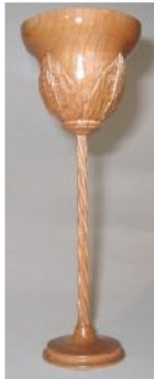
New Goblet with a twist Click to see more