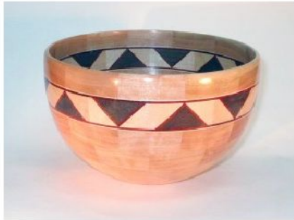
Smaller version of Cherry Southwest