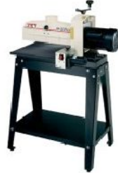
Jet / Performax 16-32 Plus Drum Sander

A segmented turners dream tool. Quickly sands glued up rings, smooth and parallel. does a nice job on thin veneer layers as well.