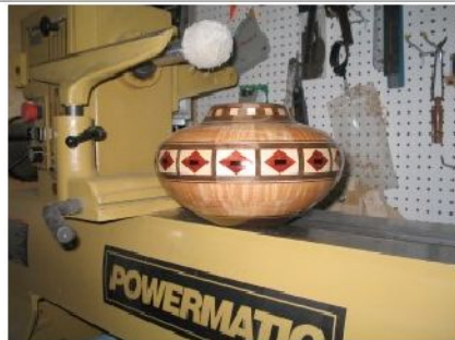
This is a Ray Allen design click picture to see more