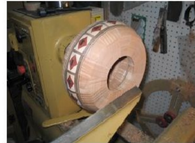
July 15th Added a few more layers