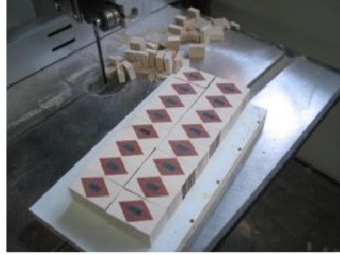
July 8th Lots of cutting and sanding for eight hours. The end result is 16 diamonds made of bloodwood, green diamondwood, and maple.