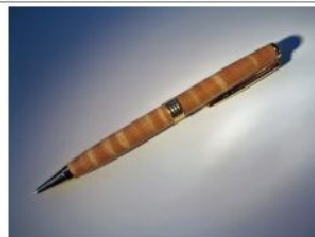
New Video Making a Curly Maple Pen