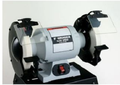
Santa delivers an 8" slow speed grinder with a Wolverine jig