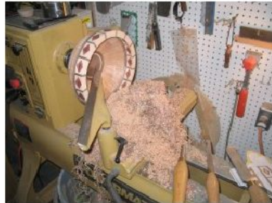
July 14th Cut more segments, glue up and some time on the lathe. Now includes walnut, and curly maple.