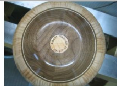
Total Pieces of wood 374 Size is 10" W by 5.25" H

July 8th '07 Updated the Workshop photos