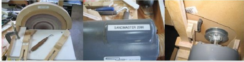
Made a Disk Sander and jigs needed to make my Current Project See How I made it...