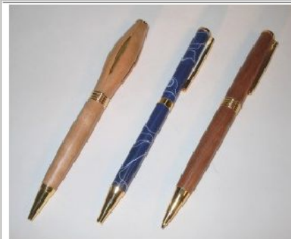
Made some pens... Left is Cherry with an inside-out top Center is turned plastic Right is made of reclaimed Rosewood